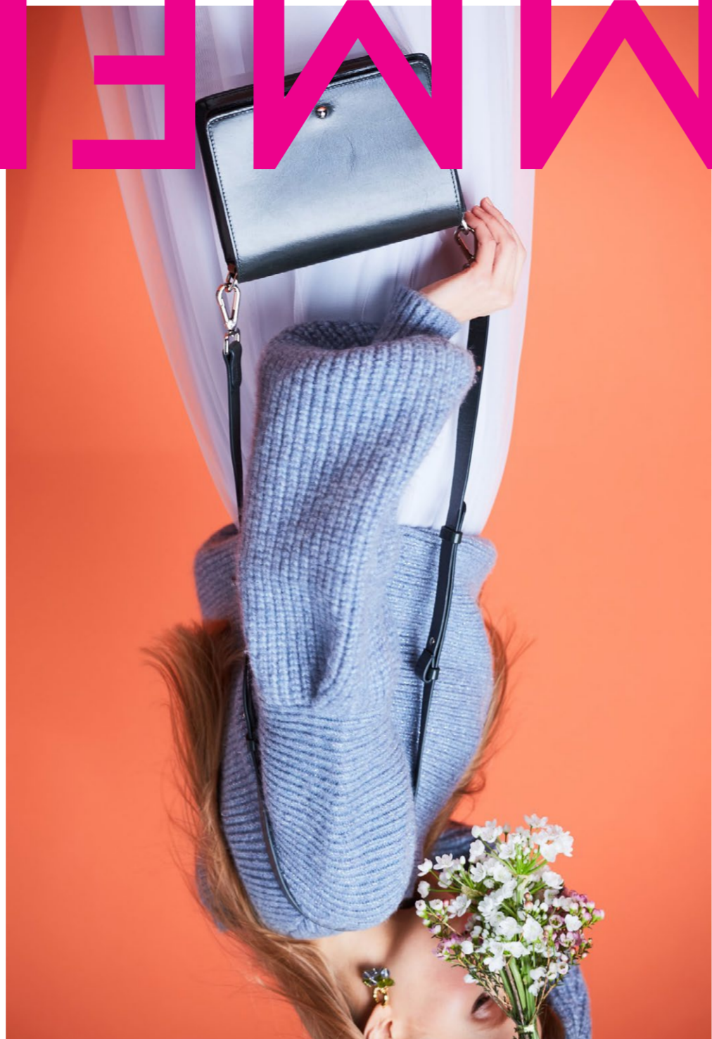
Saga Crossbody Bag, Limited Edition Senja Mini Tote, Woven Line