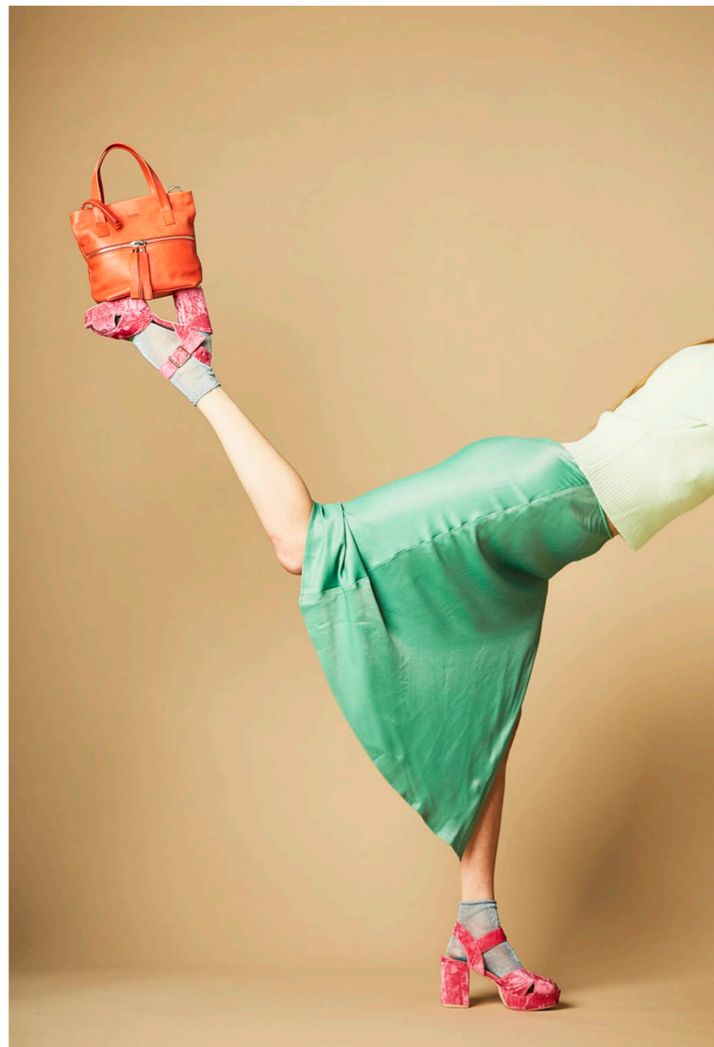
Myy Mini Tote, Soft Line