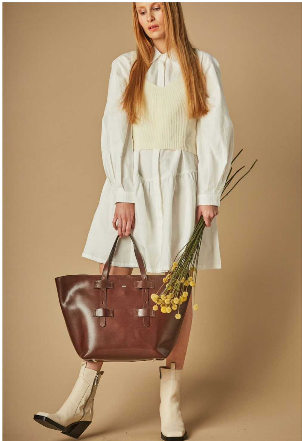
Miisa Shopping Tote, Limited Edition Linda Large Metallic Tote, Limited Edition