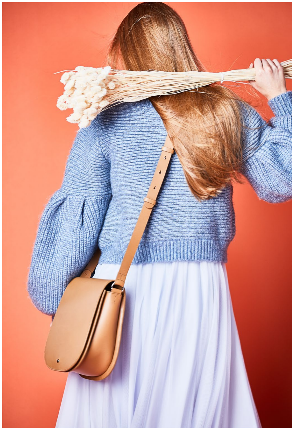
Tara Saddle Bag, Limited Edition