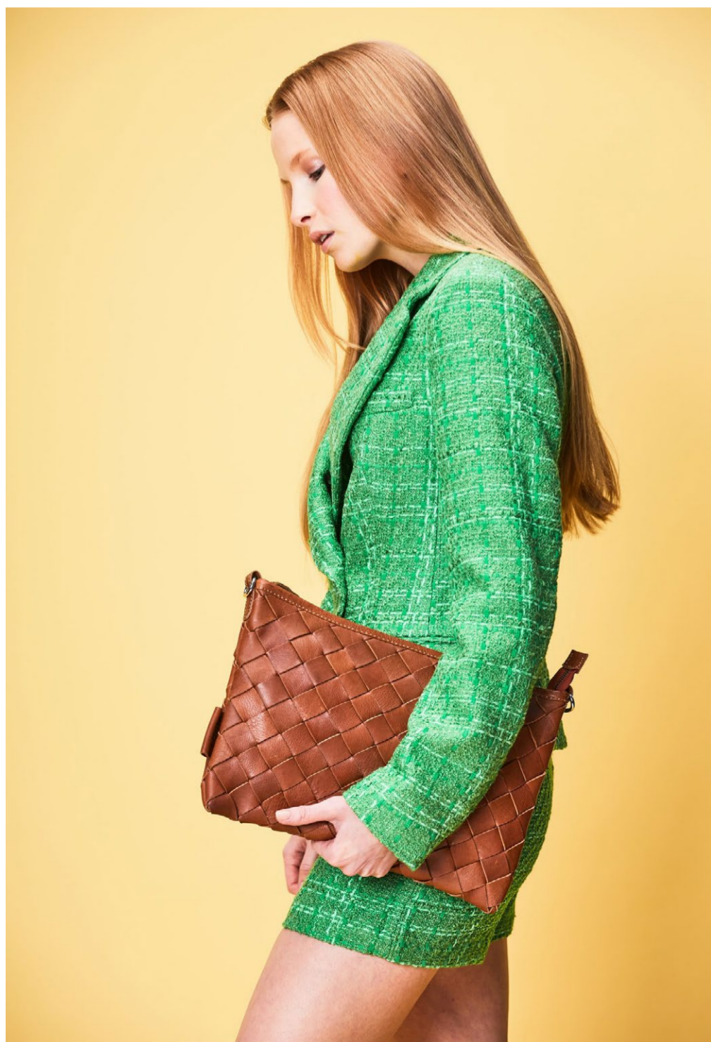
Trine Large Woven Clutch, Woven Line