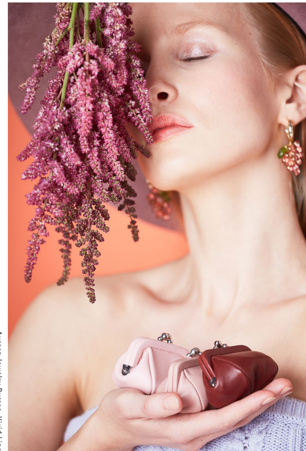
Aurora Jewelry Purses, Vivid Line